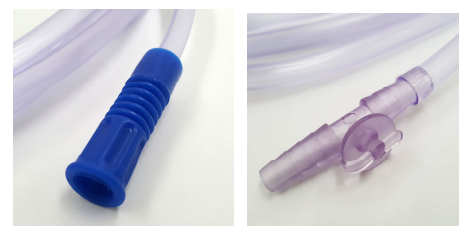
tube with funnel – Kapkon connectors