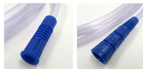
tube with funnel-funnel cut-to-fit connectors