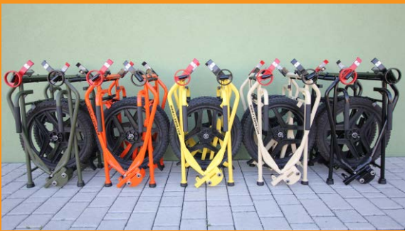
Several colors available