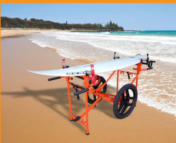
It works with any kind of board