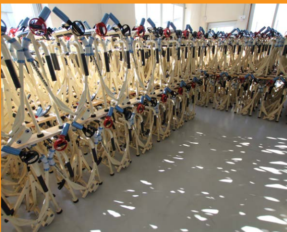
MADE IN ITALY

The EL 2000 / EL3000 field stretcher trolley complies with standard UNI EN 1865:2001 pursuant to Directive 93/42/EEC