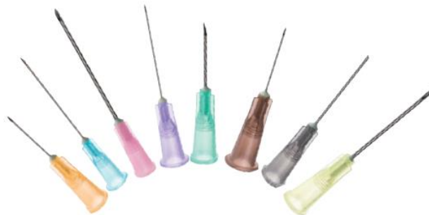
Figure 1: BD Microlance™ 3 Needles